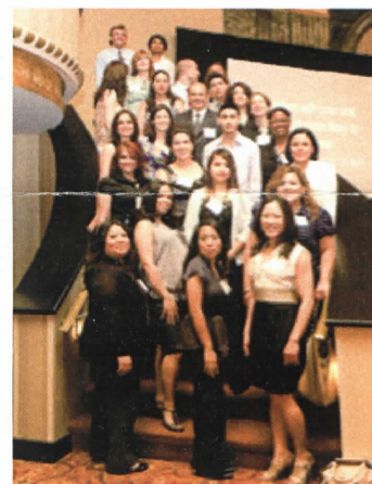
ERIE FAMILY HEALTH CENTER DENTAL TEAM